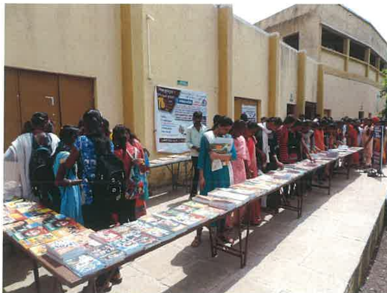
Book Exhibition And Sales.