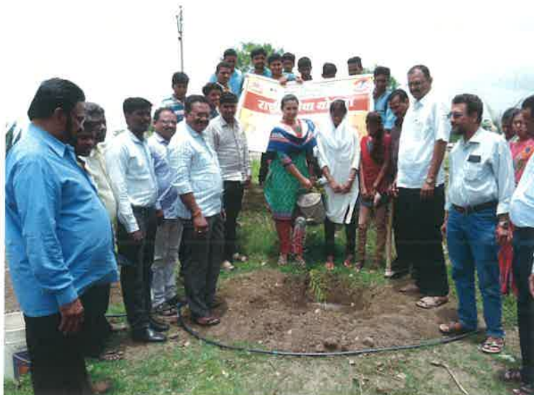
Hon. President in Tree Plantation Program.