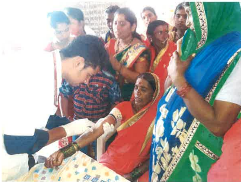
National Health Survey and check up Camp in NSS Adopted Village Kasewadi.