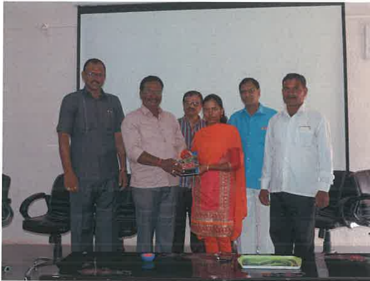
Hon. President Felicitating Meritorious Students.