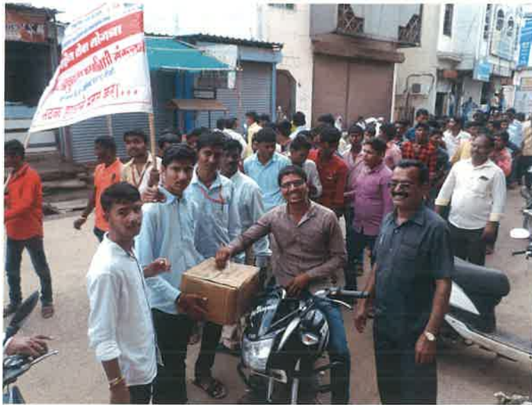
Fund Raising Rally For Kerala Flood Victims.