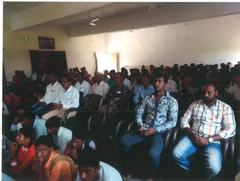
Students and Staff in Audience.