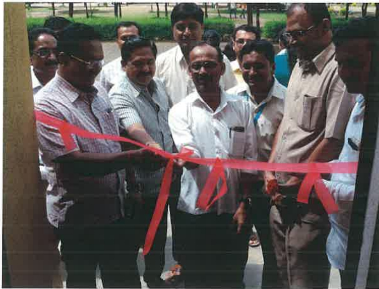
Book Exhibition Inauguration