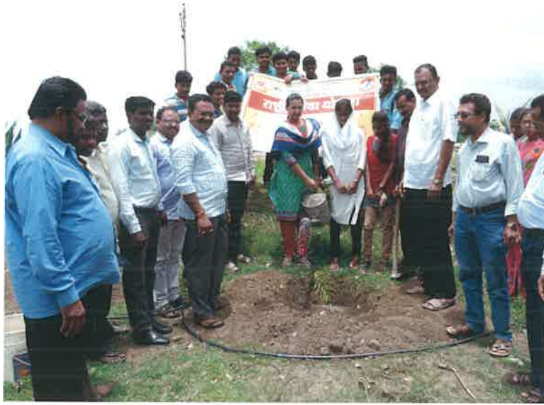
Tree Plantation Program.