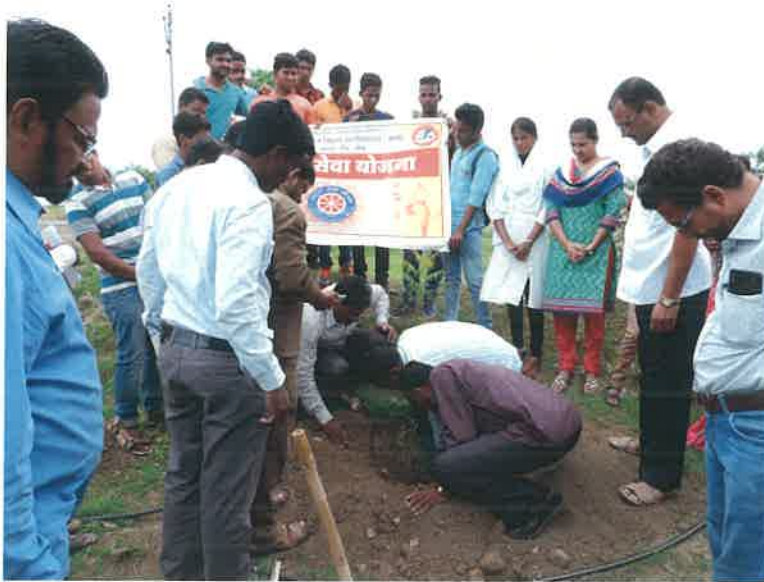
Tree Plantation Program.