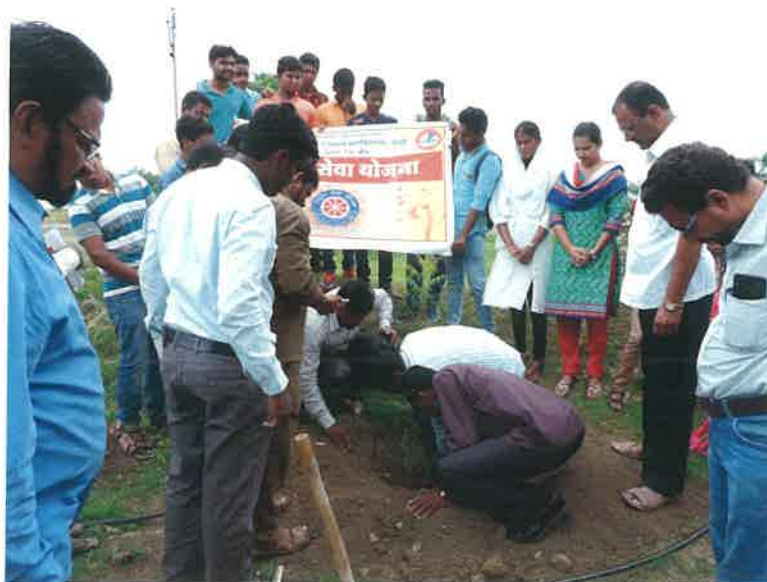
Tree Plantation Program.