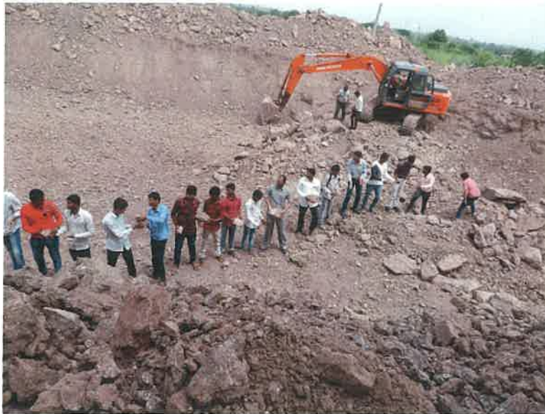
Staff and Students in Shramdanna at College Farm Pound.