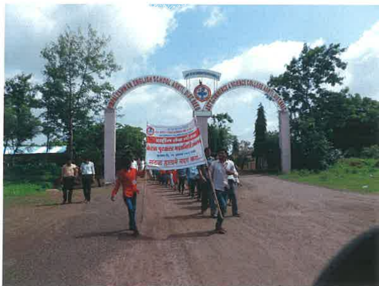
Students in a Rally For Kerala Flood Victims.