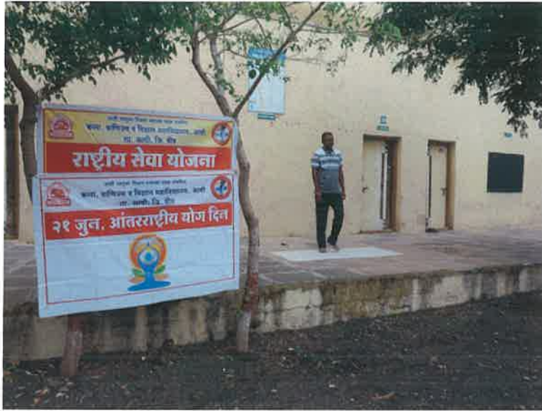
Principal Demonstrating at International Yoga Day.