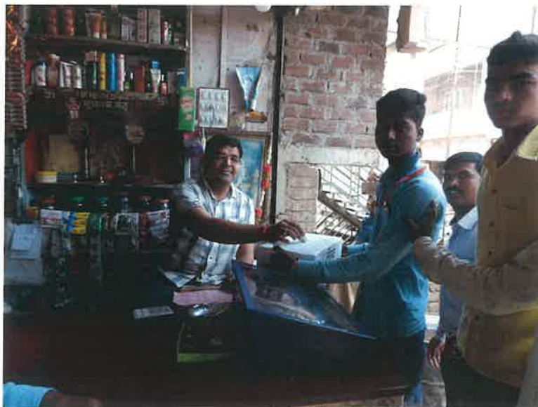
Donation For Kerala Flood Victims.