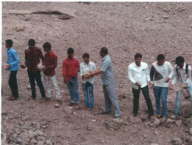
Staff and Students in Shramdanna at College Farm Pound.