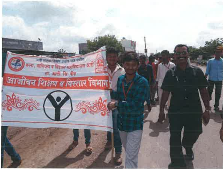
A Rally for For Kerala Flood Victims.