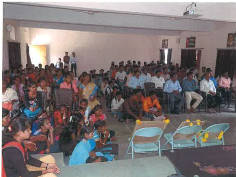
Celebrating Birth Anniversary of Annabhau Sathe, Munshi Premchand & Death Anniversary of Lokmanya Tilak.