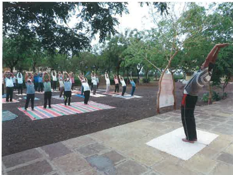
Staff and Students Performing Actual Yoga.