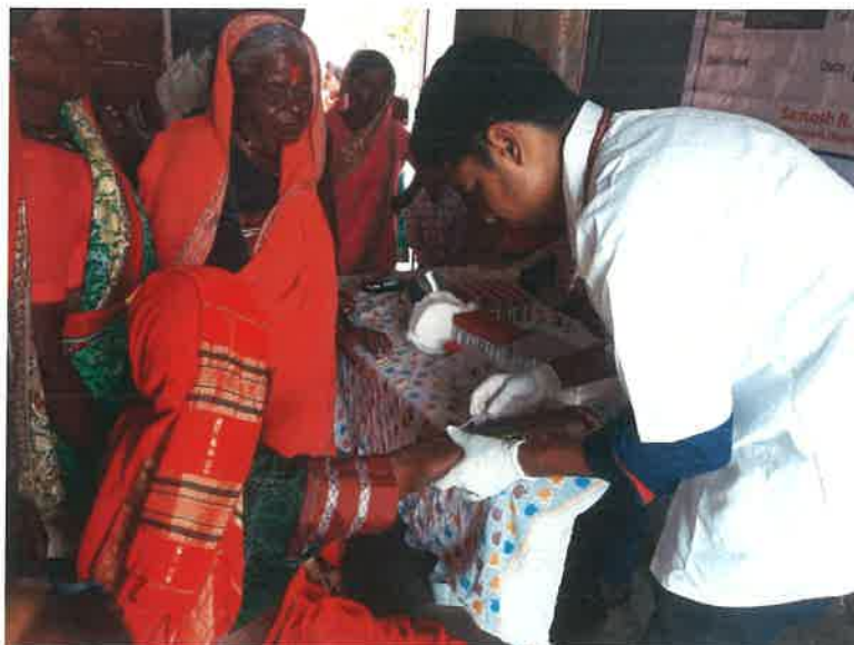
National Health Survey and check up Camp in NSS Adopted Village Kasewadi.