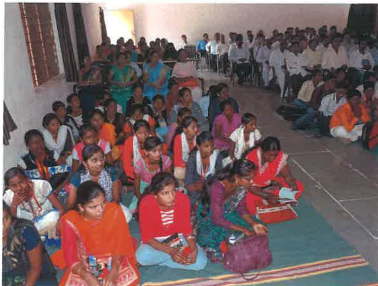
Students and Parents in Audience.