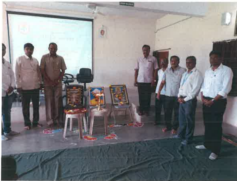
Teachers' Day Celebration