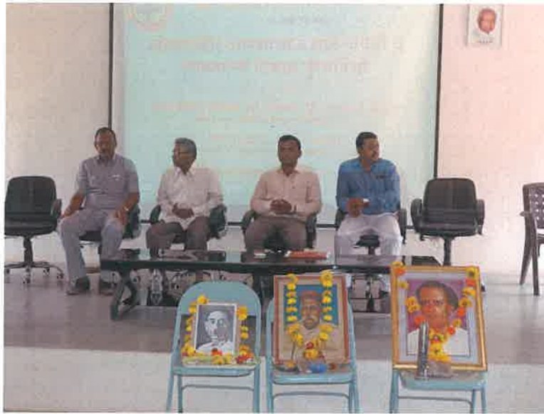
Celebrating Birth Anniversary of Annabhau Sathe, Munshi Premchand & Death Anniversary of Lokmanya Tilak.